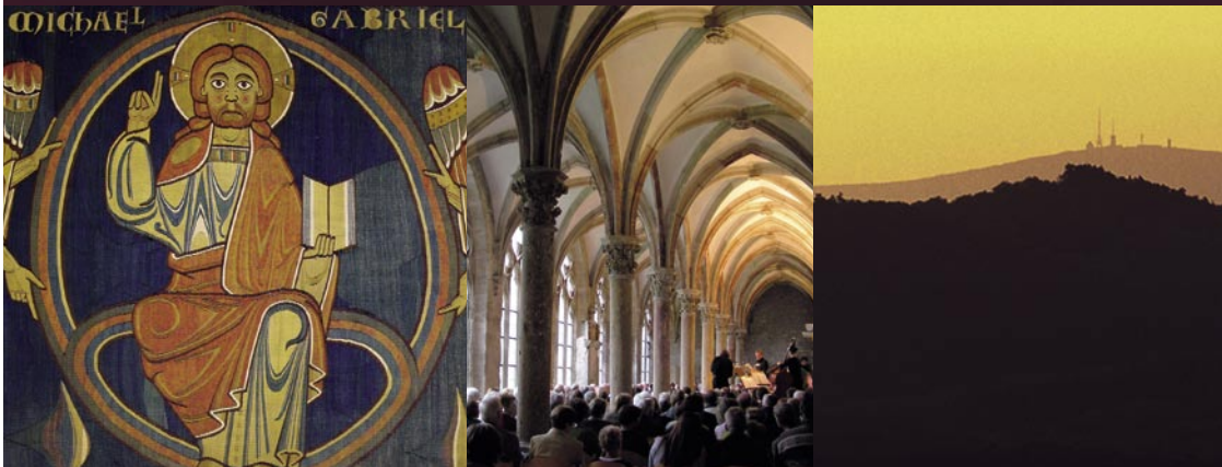
left to right: The apocalyptic Christ, the Christ-Apostle Tapestry, Halberstadt Cathedral treasure. The Cistercian Monastery Walkenried. View of the Brocken.