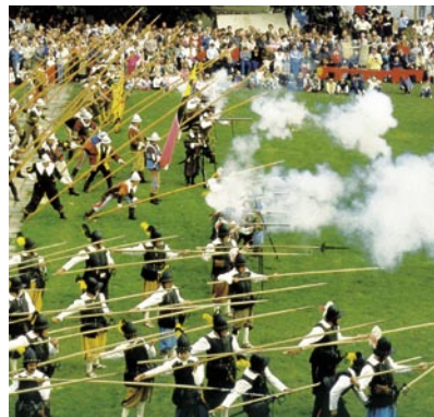
left to right: Historical Town Hall of Wernigerode. Historical Sehusa-Festival in Seesen.