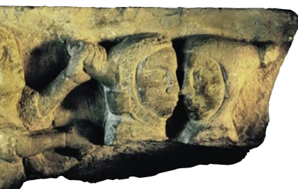
Sandstone capital 12 th century, aka Jealousy Capital

Thanks to Richard Wagner, everyone has heard about the singers’ contest at the Wartburg through “Tannhäuser”, which according to legend took place in 1206. Moritz von Schwind created the famous fresco of this early cultural competition. In the Elisabeth boudoir you can see mosaics of the saint who committed herself to the ideal of poverty of Francis of Assisi. For a short period of time the Wartburg was also home to Junker Jörg – Luther. Protected by his electoral prince he translated the New Testament from Greek into German. The oldest part of the castle is the Roman palas, the first of this type of building. It has remained the most important secular Romanesque building in the German-speaking world – artistically and architecturally.