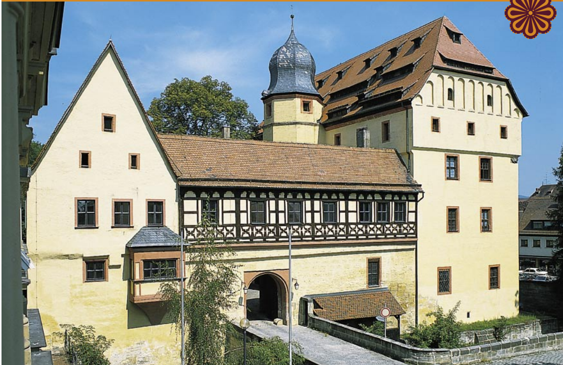
Imperial Palace Forchheim