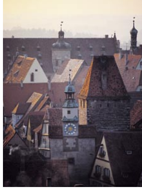
left to right: Rothenburg/Tauber, Schweinfurt Town Hall.