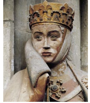
View of Merseburg Cathedral and Castle from the River Saale. Halberstadt Cathedral is one of the most beautiful church buildings in Germany. "Uta von Ballenstedt", one of the founder statues at Naumburg Cathedral.

and Saaleck Castle are examples of well-fortified medieval castles.